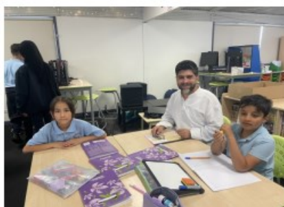
Working with the teacher