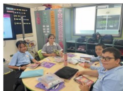
Working with friends