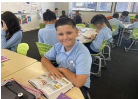
Enjoying reading sessions