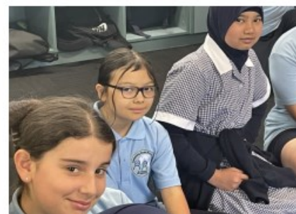
Catching up with old and new friends